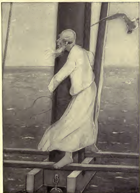
SHEM IN THE LOOKOUT